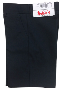
NAVY SHORTS - BOYS