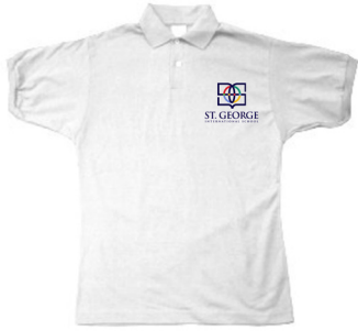
WHITE POLO - ALL

11626 Sherwood Forest Ct. Baton Rouge, Louisiana 70816 (800) 780-8751