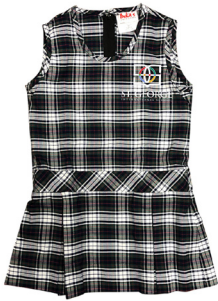
PLAID JUMPER - GIRLS