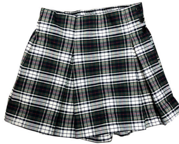
PLAID SKORT - GIRLS