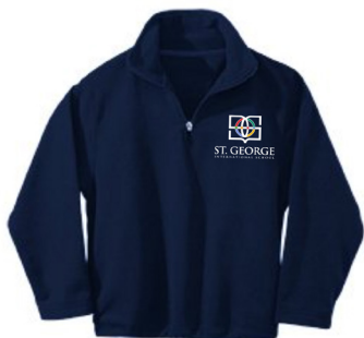
NAVY FLLEECE - ALL