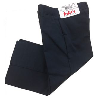
NAVY PANTS - BOYS