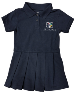
POLO DRESS - ELIS & PRE-K GIRLS