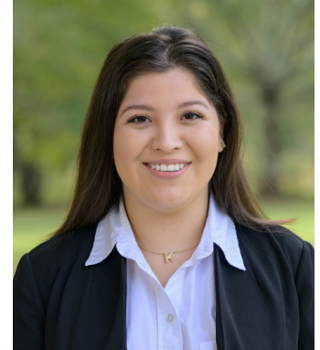
Ms. Kimberly Diaz Elementary