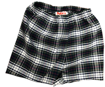
PLAID SHORTS - GIRLS