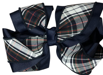
ANY PLAID #33 ACCESSORIES - GIRL