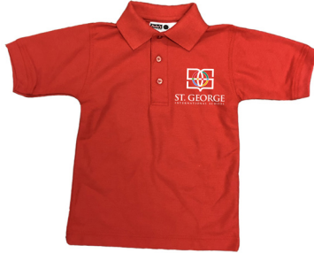
RED POLO - ALL