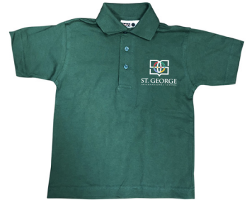
GREEN POLO - ALL